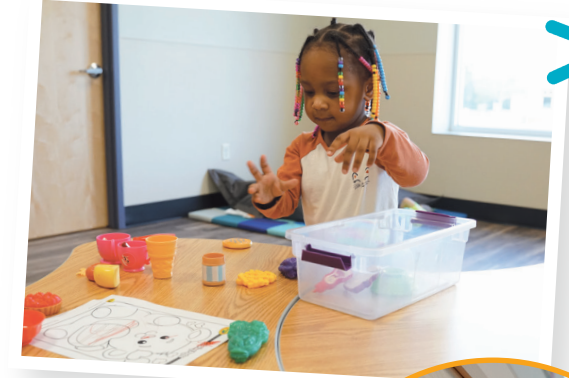
Autism Day Program kids playing with toys and supplies from the Community Foundation of Johnson County grant

Thank you, Community Foundation of Johnson County, for your generosity, support and partnership in helping us transform the lives of children with autism in our community.